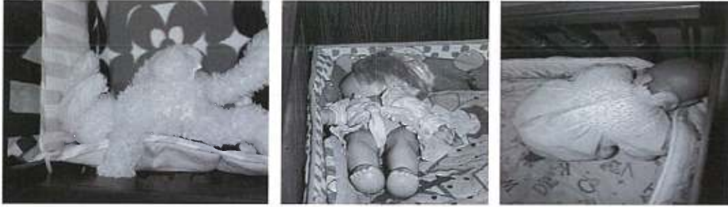
Figure 2. Examples of "thin" bumpers from death scene recreations.